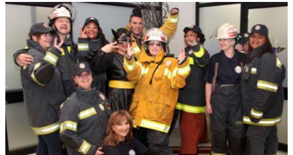
No-one can dispute that our disaster-response team is everyone's hero. Dressed in full regalia, the Withuis team fully enjoyed adding a little fun to the event.