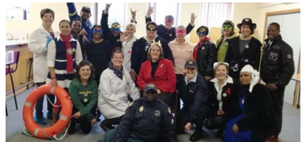
Interspersed by a couple of real-life and not-so-real-life superheroes, the Gansbaai Administration thoroughly enjoyed dressing up as well.